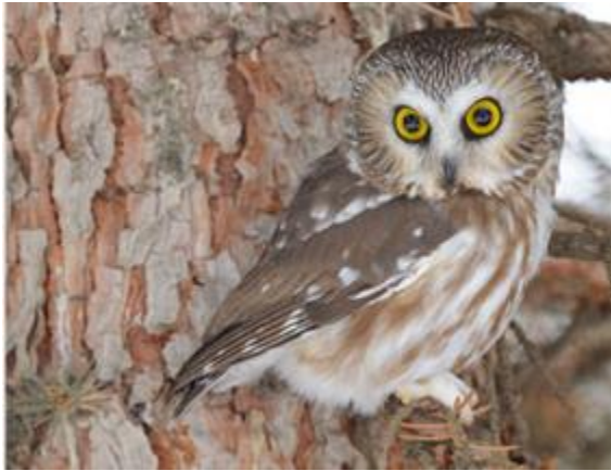
Northern Saw-whet Owl