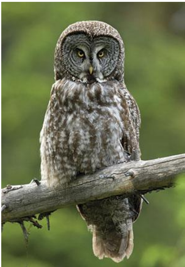
Great Gray Owl