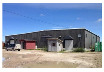
Attawapiskat water treatment plant.

Climate change is expected to increase precipitation in northern Ontario and large rain events (50mm to 150mm in one day) are projected to happen more often. Increased snow loads and heavier rains can cause more runoff (when water flows over the land) and flooding, which can carry contaminants like animal and human waste and oil into waterbodies contaminating drinking water. This can stress water treatment plants.